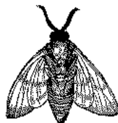
Figure 3. A sample black and white graphic that has been resized with the includegraphics command.

proofs. ACM uses two types of these constructs: theorem-like and definition-like.