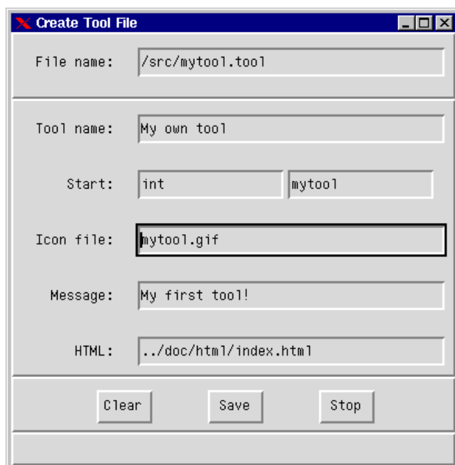
Figure 1.2: The Create Tool File Window

This window is displayed when you select Create Tool File from the Tools menu. The following illustration shows The Create Tool File Window .